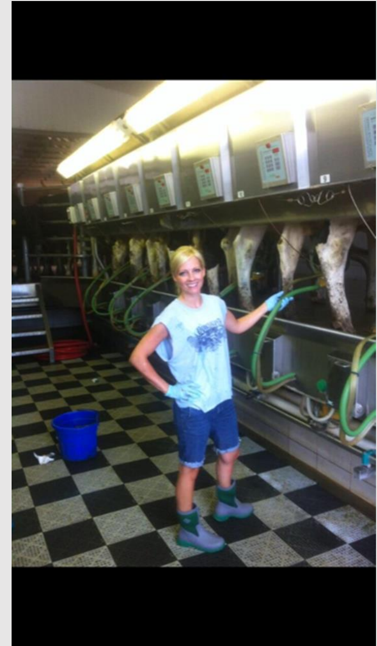
Rosevale Farms: 160 cows, East Chilliwack